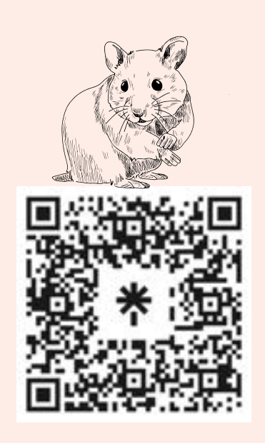
Interested in learning more about the URF? Follow the QR code above!!

sexuality in tangent, as well as recording their involvement in the church and with other LGBTQIA+ identified people. The goal of this research is to problematize the common narrative that suggests that queer identities and Christianity are mutually exclusive.