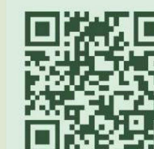
LinkedIn profile link

LinkedIn: www.linkedin.com/in/kennethsaintonge